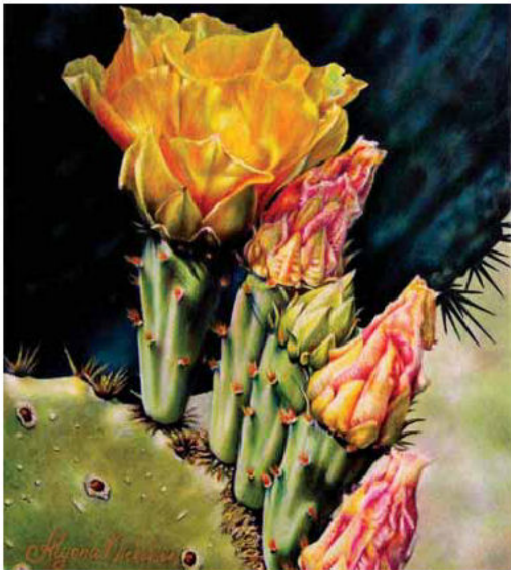
ALYONA NICKELSEN, DESERT ROSE, COLORED PENCIL, 10½ x 8"