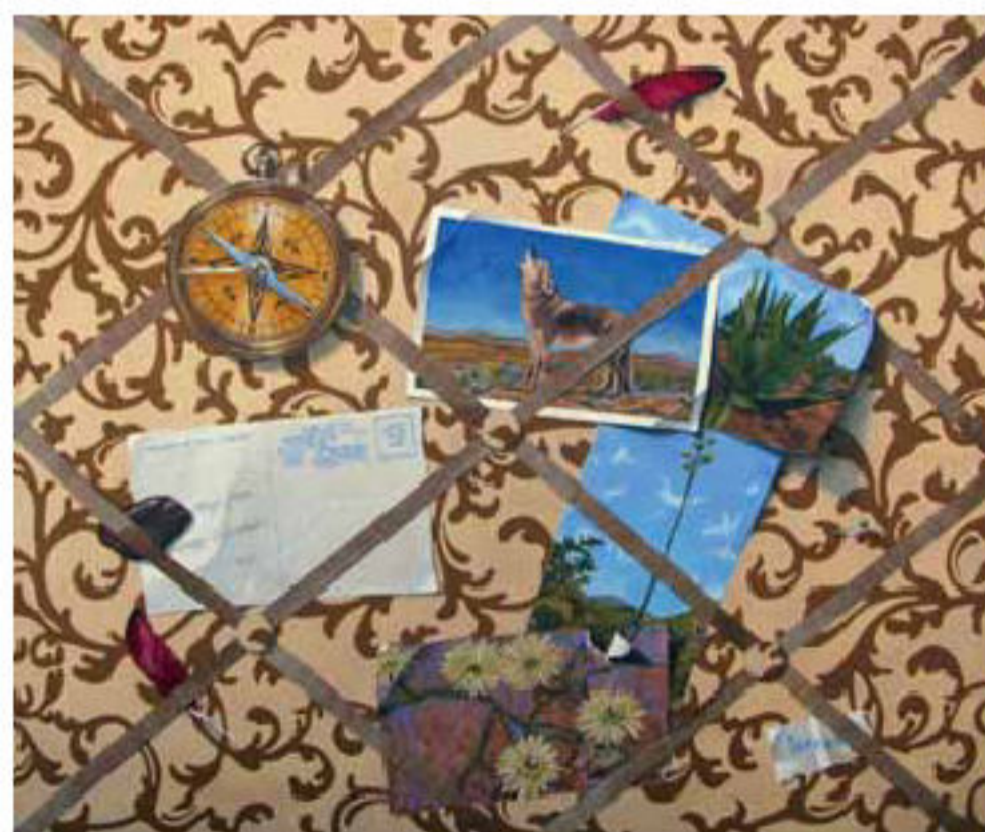
LORENA KLOOSTERBOER, GREETINGS FROM SUNNY SCOTTSDALE, ACRYLIC ON PANEL, 19 X 16"