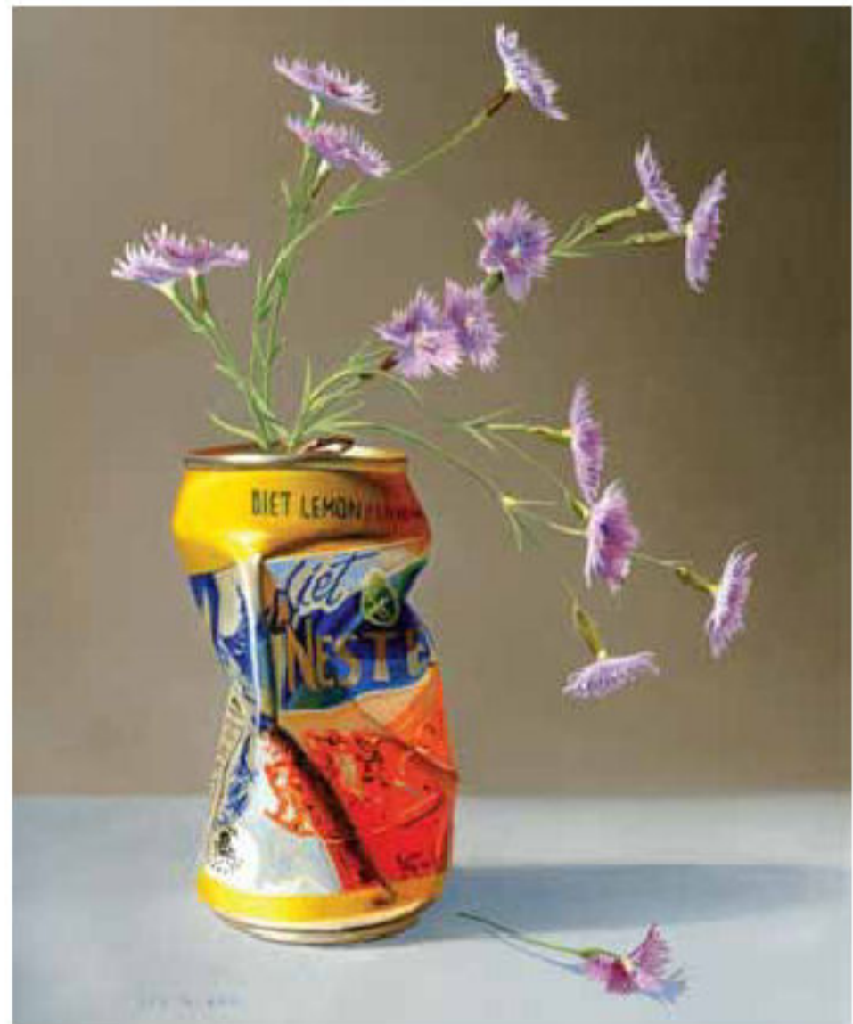
LEE ALBAN, NATURAL INGREDIENTS ADDED, OIL, 12 X 9"