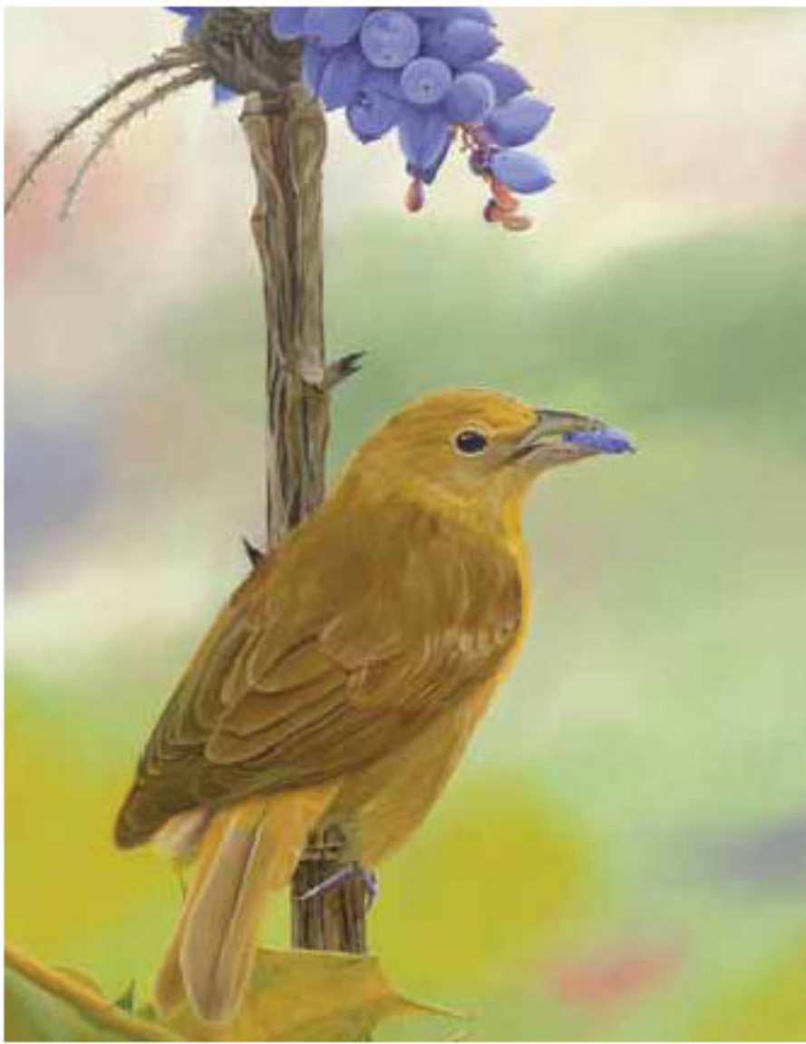
CAMILLE ENGEL, BERRY EATER, OIL, 30 x 20"