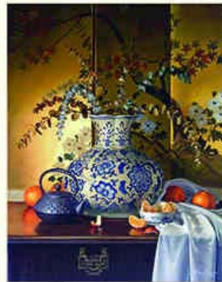
"THE IRON TEAPOT", OIL, 24'X20, B. NICOLE KLASSEN

Over fifty of the leading Realism artists from around the world will be unveiling their newest paintings at our new gallery in the heart of Dennis Village. This will be the largest exhibition of Realism ever held in New England with awards to be given the day of the show at 4 PM. With over 200 entries, artwork was juried to just over 50 of today's leading artists to offer you the best in contemporary Realism. This exhibition will feature a wide spectrum of styles within the Realism genre. Photo-realism, trompe l'oeil, contemporary realism, classic realism, and the latest cutting-edge compositions from overseas will be featured at this show. We invite you to take this opportunity to obtain a museum masterpiece for your own collection and to meet many of these exceptional artists.