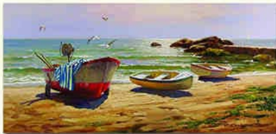
"BOATS", O/C, 12'X24, VADIM DOLGOV